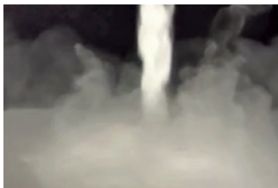
Comparable non-neutralized dry powder